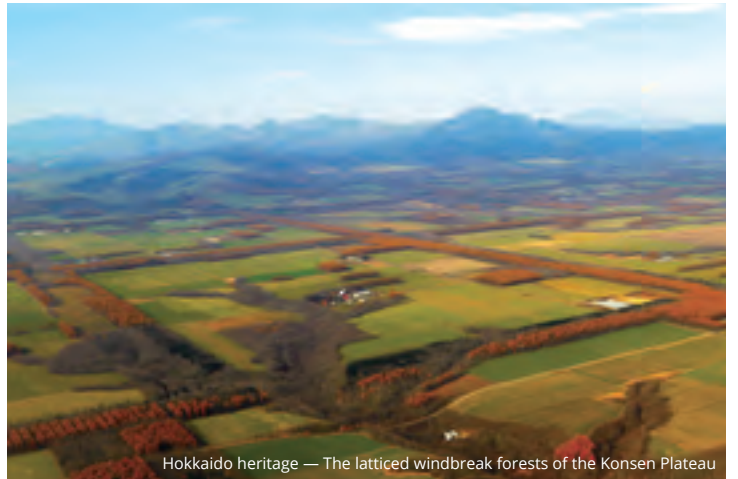
Hokkaido heritage — The latticed windbreak forests of the Konsen Plateau