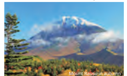
Mount Rausu in autumn