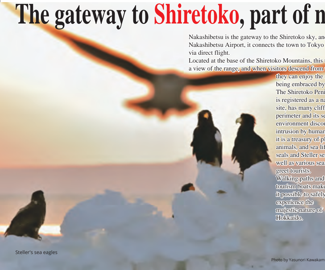
Steller's sea eagles