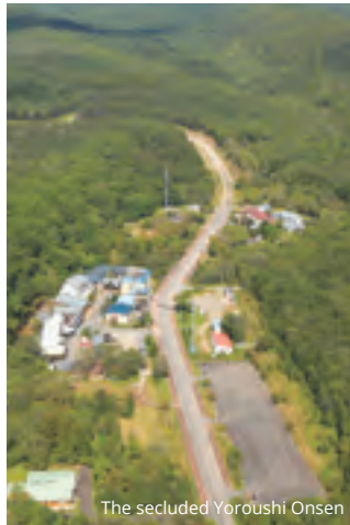
The secluded Yoroushi Onsen

From Uramashu Observatory, visitors can see a hidden view of Lake Mashu that has charmed many a traveler.